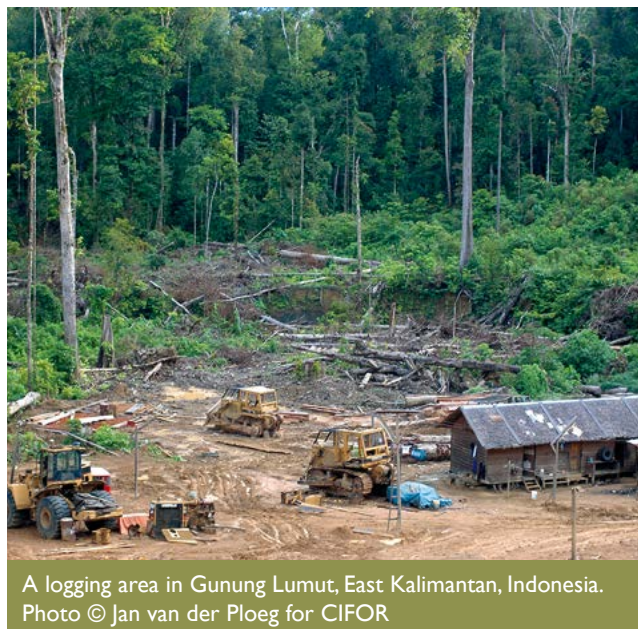
A logging area in Gunung Lumut, East Kalimantan, Indonesia.

Large-scale illegal logging, in its different illegal facets, leads to cumulative impacts. It does so by affecting livelihoods not only by excluding local people from forest areas, but also due to limited distributive effects at the local level. It also contributes to the loss of state revenue, which along with inefficient fiscal systems of state revenue capture, results in less income for producing zones, thus diminishing their capacity to use economic rents from forests for social and productive investments. Large-scale illegal logging, in the context of weak accountability, also fosters corrupt behaviours and networks, which in some cases link with other illicit activities. Forest degradation, along with destruction of habitats, also leads to biodiversity loss, and has impacts on climate change. Finally, carbon emissions from large-scale logging have an important role in driving global climate change, while it is plausible that degradation via intensive illegal logging will reduce the resilience of logged-over forests to adapt to climate change, especially under more frequent drought events that may increase fire risk.