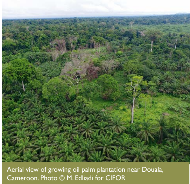
Aerial view of growing oil palm plantation near Douala, Cameroon.

A portion of timber supplied to domestic and international markets originates from forests converted to agriculture. This proportion varies greatly over time and across countries. For example, this situation has changed recently due to the drastic reduction of illegal land clearing in Brazil, which is currently mainly associated with smallholders (Godar et al., 2014). Conversely, land clearing continues in Indonesia due to the development of plantations (Margono et al., 2014). The situation is less clear in other tropical countries since deforestation has tended to grow in the Andes-Amazon countries (Coca-Castro et al., 2013), and pressures on land have been expanding in Western and Central Africa (Feintrenie, 2014). In the latter regions, while most past deforestation was driven by smallholders, increasing pressure has been placed by large-scale investments