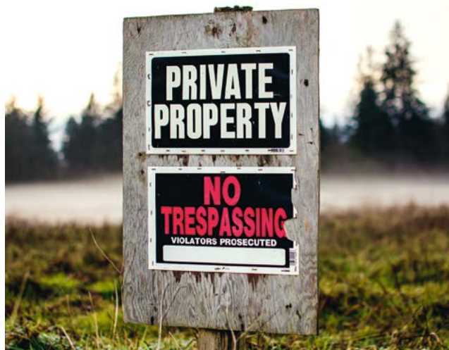
Private property sign.

The social impacts of illegal forest activities tend to be contradictory. One main factor that makes many instances of small-scale logging illegal is that many forestry laws still do not recognize customary use rights (Colchester, 2016). Smallholders, indigenous people and other traditional communities often tend to benefit from conducting their timber extraction operations outside of the law,