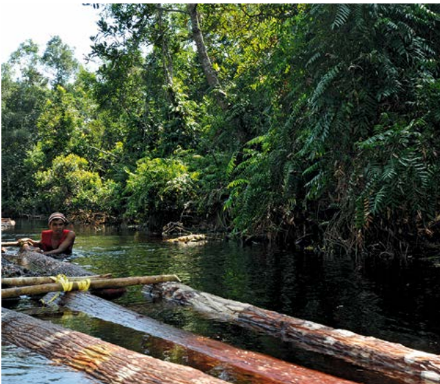
Transporting logs along the river Indonesia.

The states are the main losers in the persistence of small-scale informal logging as well as with the development of small-scale chainsaw milling, which goes against their strategy of formally managing and taxing forest resources. In addition to foregone tax revenue, small-scale chainsaw milling could compromise their efforts to sustainably manage forests. While benefits are appropriated locally,