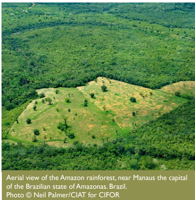
Aerial view of the Amazon rainforest, near Manaus the capital of the Brazilian state of Amazonas, Brazil.

more efficiently law transgressions. The economic gains generated through illegal logging also contribute to reproduce relatively extended political patronage systems to continue profiting from illegal logging and forest conversion. Illegal logging contributes to increase misappropriation of public resources, and interestingly efforts to combat corruption have contributed to reduce the power of corrupt networks, embedded in the political systems.